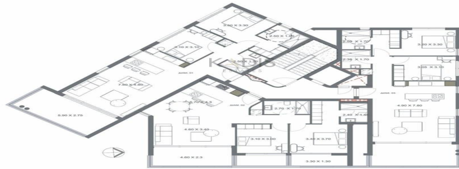
TYPICAL FLOOR NOT TO SCALE