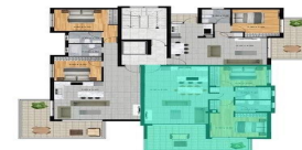
FLAT 102, 202, 302, 402+ 502 Internal Area # 82.00 SQM Covered Veranda # 20.50 SQM

* All moving furniture and appliances are for illustration only. * All dimensions are approximate and differences may occur during the construction work.