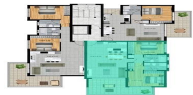
FLAT 102, 202, 302, 402+ 502 Internal Area # 82.00 SQM Covered Veranda # 20.50 SQM

* All moving furniture and appliances are for illustration only.