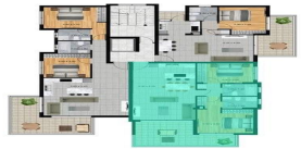
FLAT 102, 202, 302, 402+ 502 Internal Area # 82.00 SQM Covered Veranda # 20.50 SQM

* All moving furniture and appliances are for illustration only.