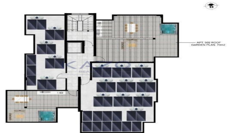
ROOF PLAN / ROOF GARDEN