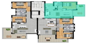
FLAT 103, 203, 303, 403+ 503 Internal Area # 53.00 SQM Covered Veranda # 13.00 SQM

* All moving furniture and appliances are for illustration only. * All dimensions are approximate and differences may occur during the construction work.