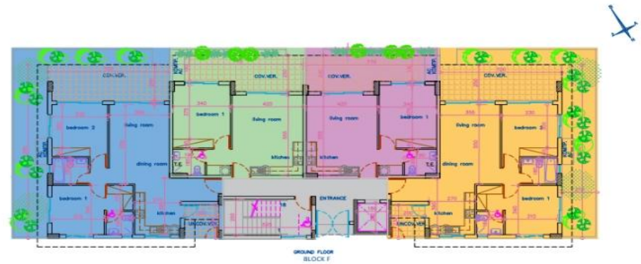
GROUND FLOOR BLOCK F