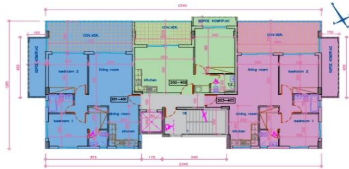
KATΩH 201-202 DPWOF BLOCK E