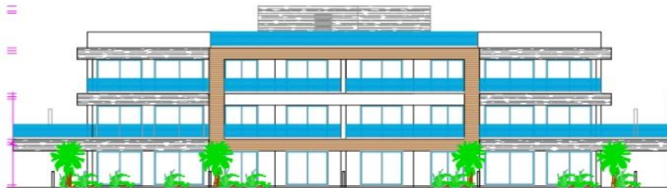
1000 000-0000 000 BLOCK F