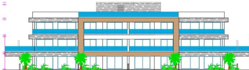
FRED OWN-BOPERA OWN BLOCK F