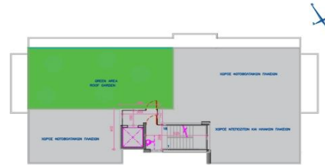
KATΩH 200000000000 BLOCK E