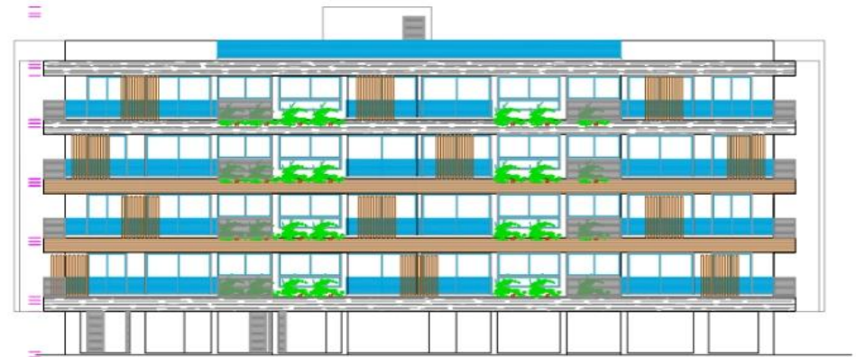
NOTO ANITONIKI OHI BLOCK H