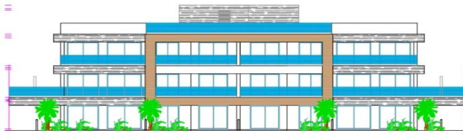
200-400-200-400 BLOCK F