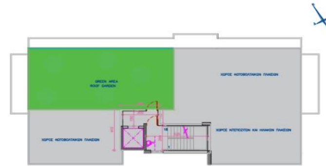
KΑΤΩΗ 191-192 ΔΩΜΑΤΙΟ BLOCK E