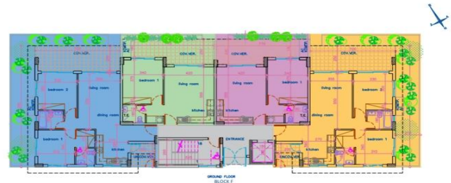
GROUND FLOOR BLOCK F