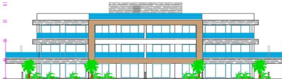
200-400-200-400 BLOCK F