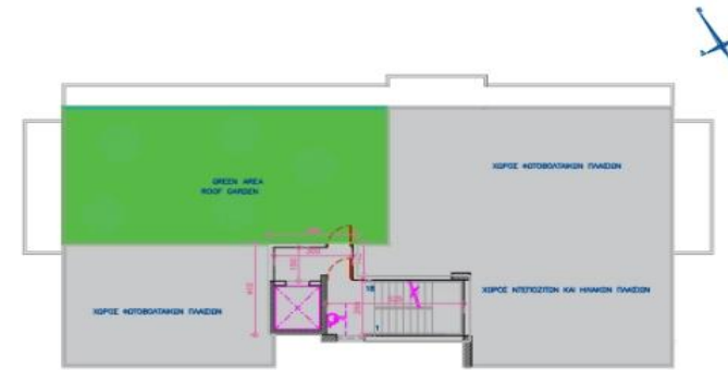
KATΩH 100000000 BLOCK E