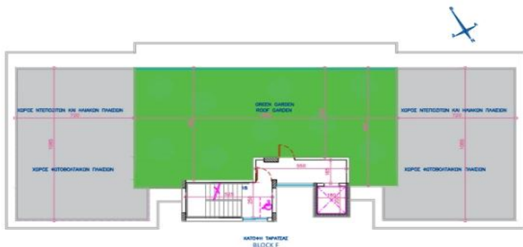
KATON THAPAZAE BLOCK F