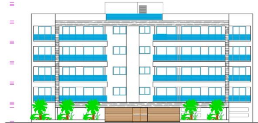
EPICEDHYN-NOTIA DWH BLOCK B