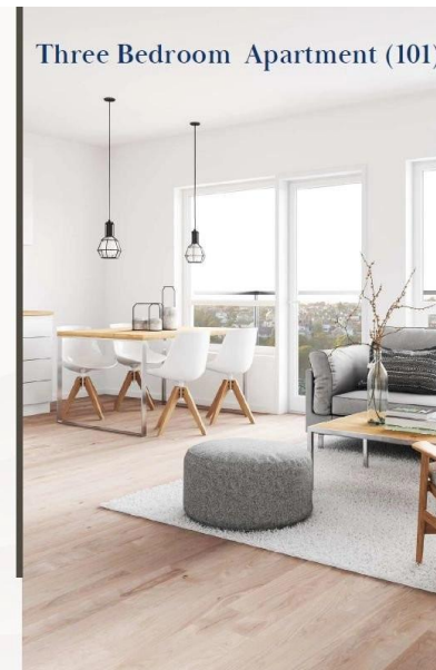
Three Bedroom Apartment (101)