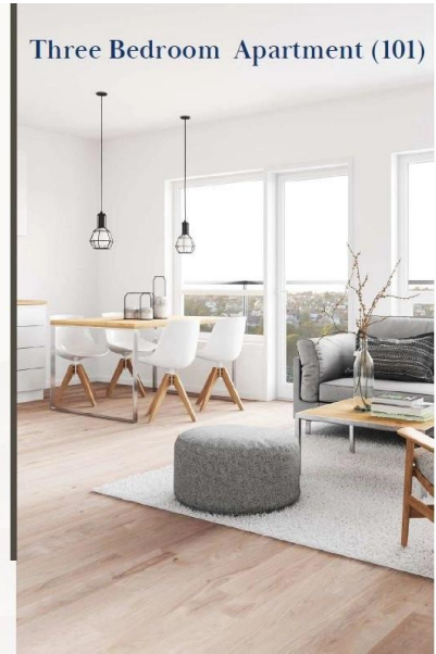
Three Bedroom Apartment (101)