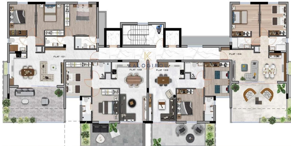
Roof Top Floor