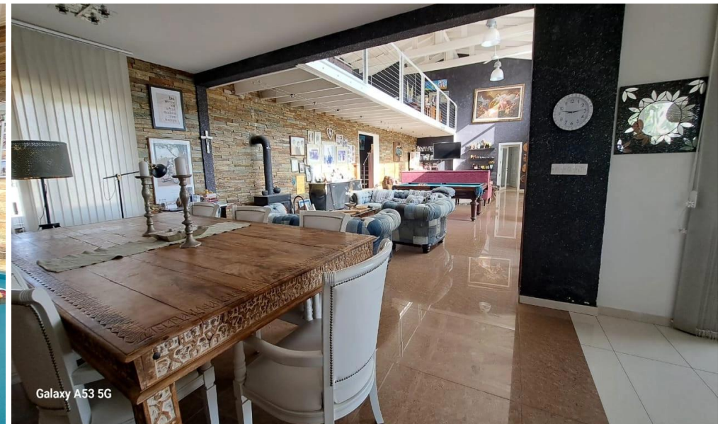
Galaxy A53 5G