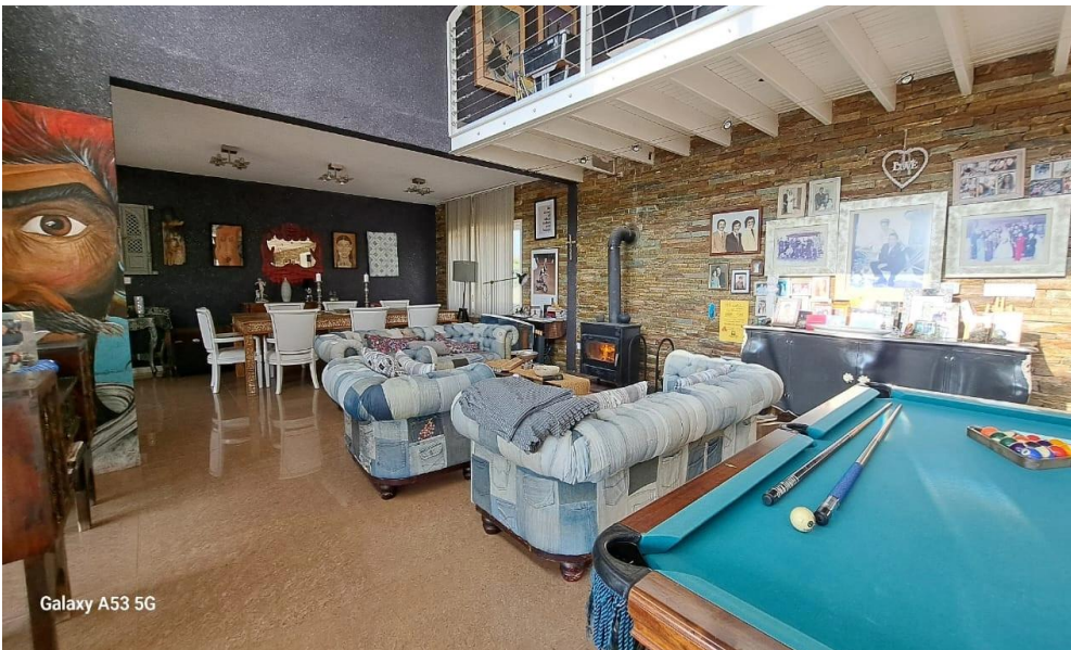
Galaxy A53 5G