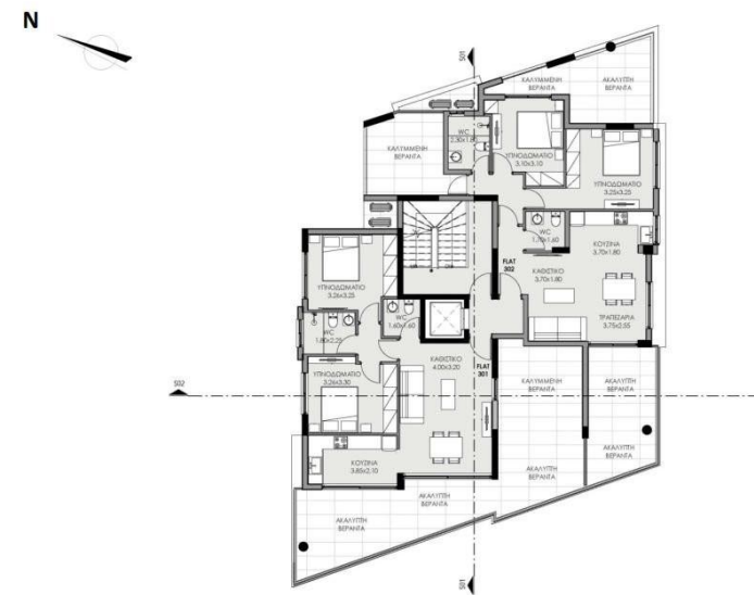
3 rd Floor