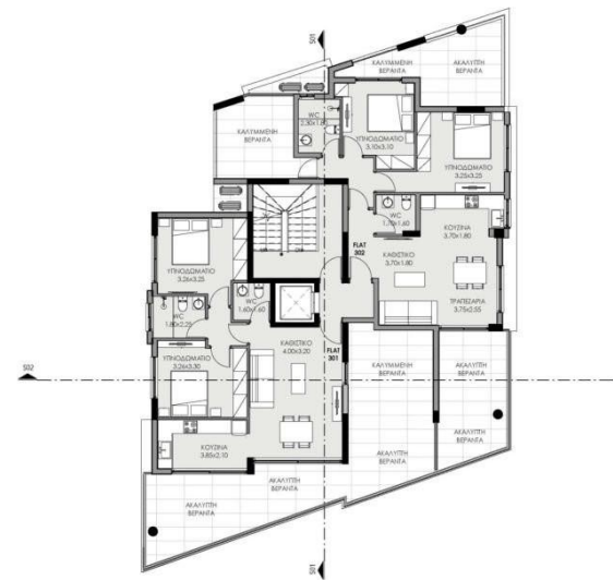
3 rd Floor