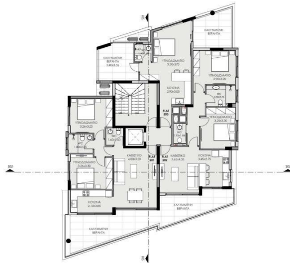
2 nd Floor