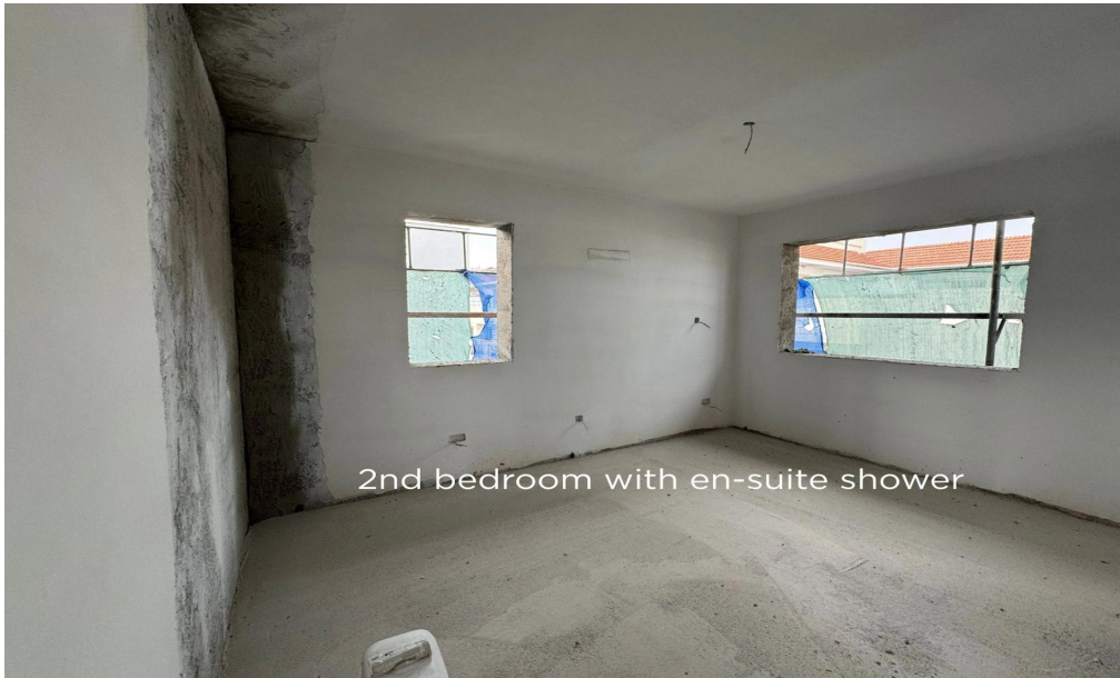
2nd bedroom with en-suite shower