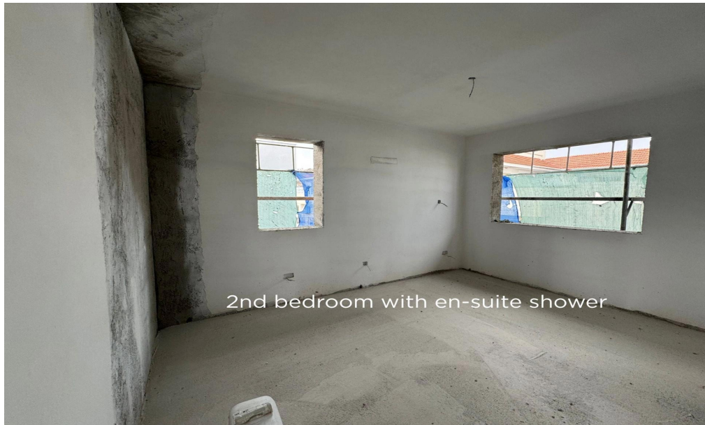
2nd bedroom with en-suite shower