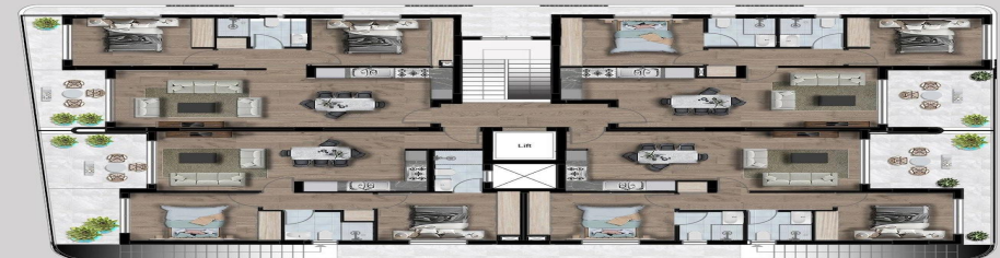
Block - A KALOGIROU