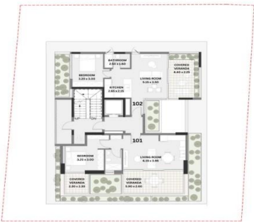
OPTION B: 1-bed apartments