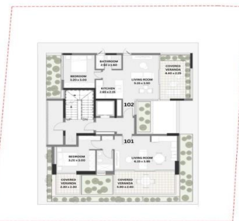
OPTION B: 1-bed apartments