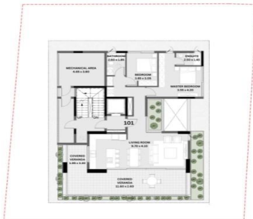
OPTION A: 2-bed apartment