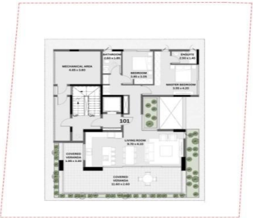
OPTION A: 2-bed apartment