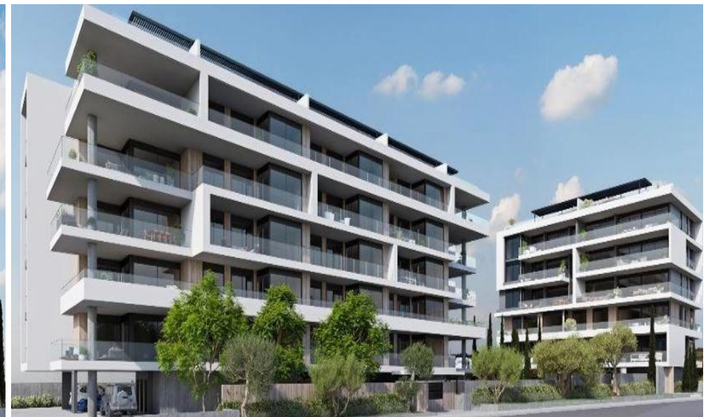
BUILDING A FLOORS 1 - 5