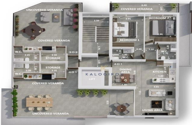
4th FLOOR PLAN