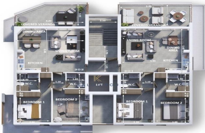
3rd FLOOR PLAN