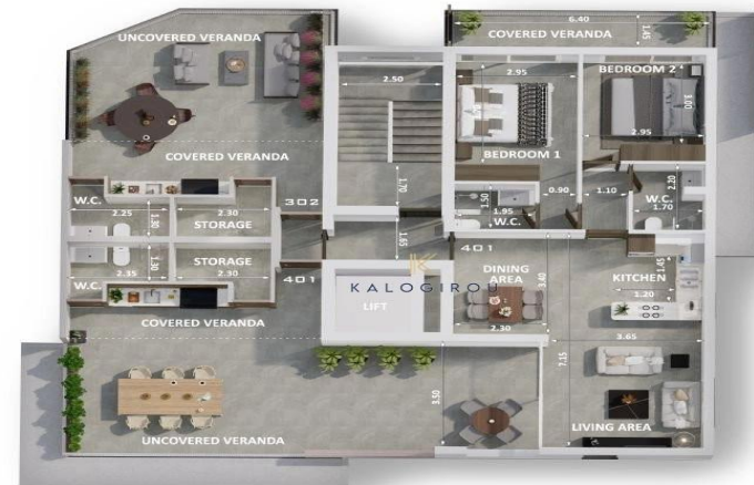
4th FLOOR PLAN