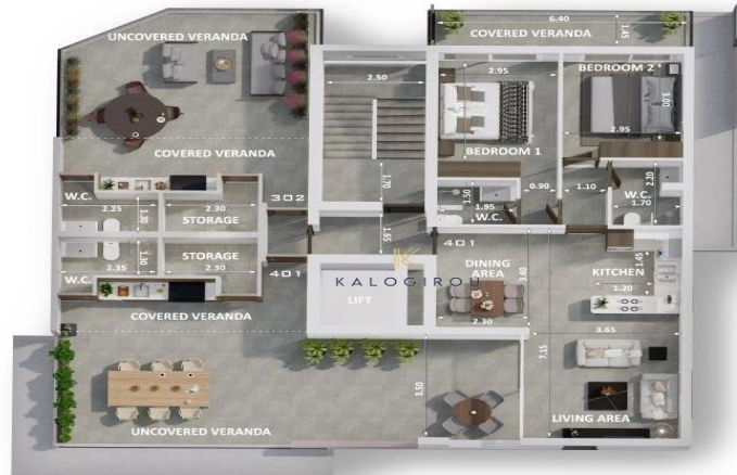
4th FLOOR PLAN