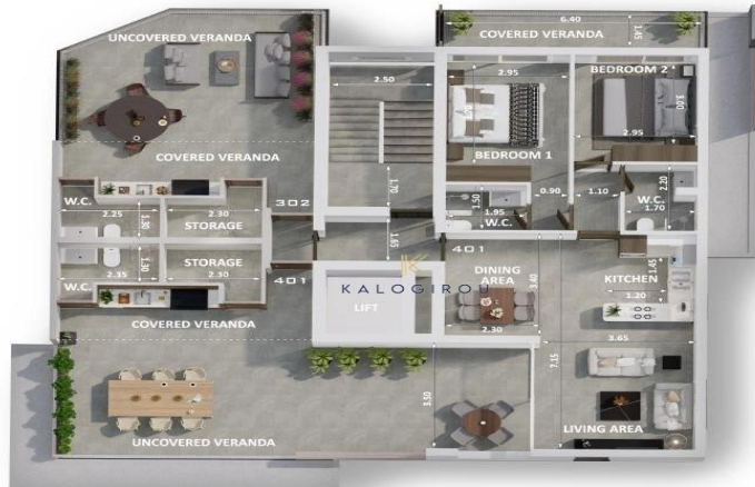
4th FLOOR PLAN