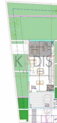
Ground floor 68.45 m 2