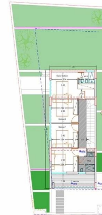
First floor 78.00 m 2