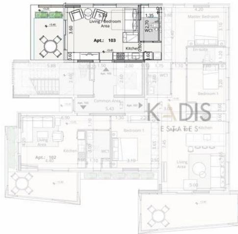
1 st , 2 nd & 3 rd Floor Apartments 103, 203 & 303

Internal Covered Areas = 35.00m 2 / Unit