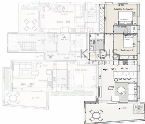
3 rd Floor Apartment 301

Storage & Common Area not included in above m 2