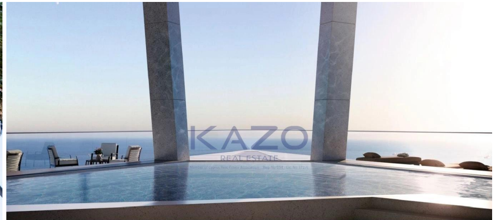
The West Tower pool at Trilogy Limassol is an exclusive outdoor infinity pool located on the 17th floor of the tower as part of the private Retreat area for residents.