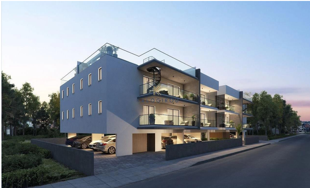
<< 1ST- FLOOR