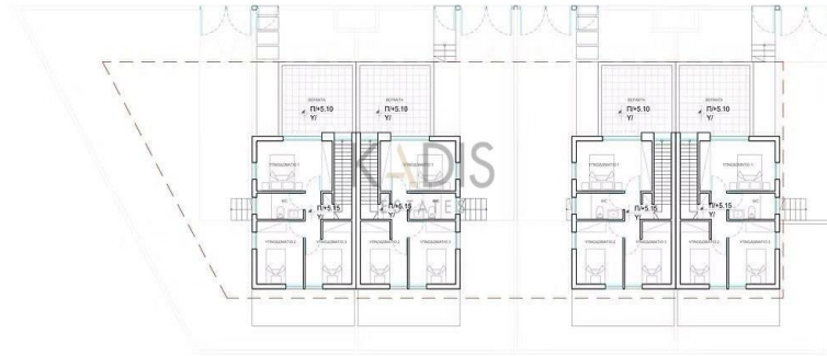
1ST FLOOR LAYOUT