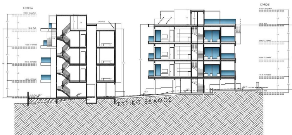
ΤΟΜΗ Α - Α ΚΛΙΜΑΚΑ 1/200