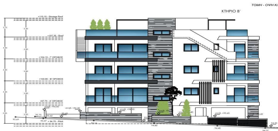
ΤΟΜΗ - ΟΥΗ Κ/Α