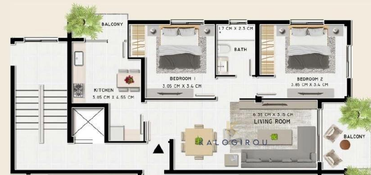
2-Bedroom Apartments Ideal for young couples or professionals.