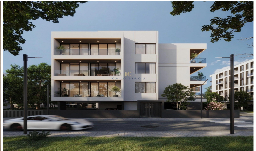
STUDIO 35 SQM + 10 SQM COVERED