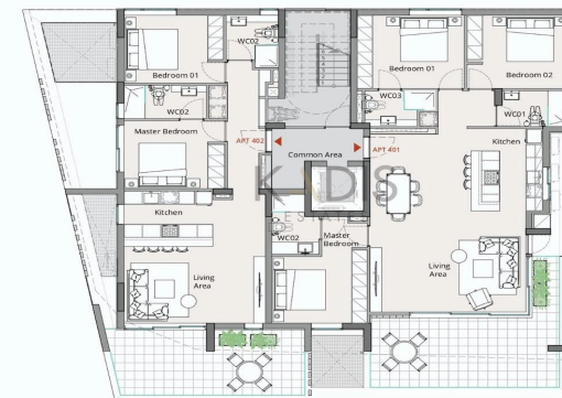
4th Floor Plan Scale 1:100