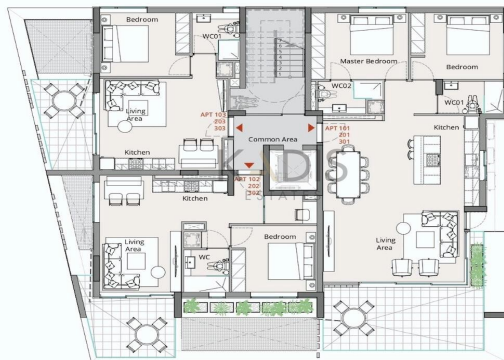
Typical Floor Plan (1st - 3rd Floor) Scale 1:100