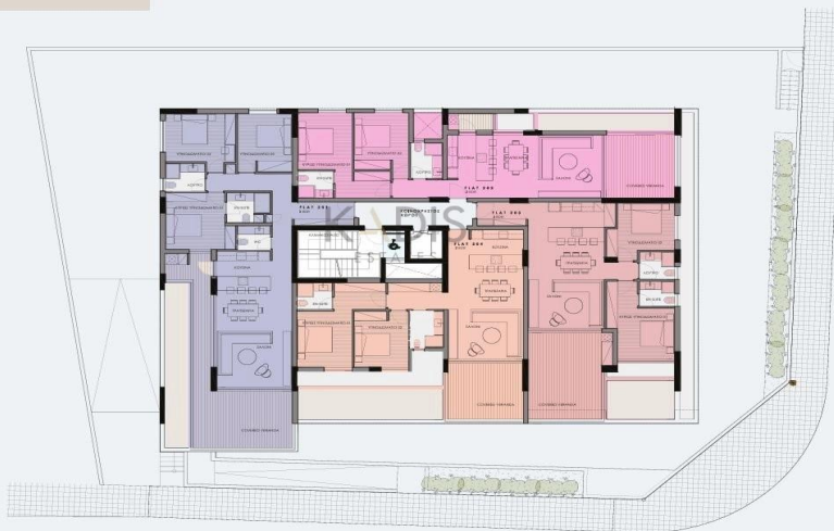
2 st Floor