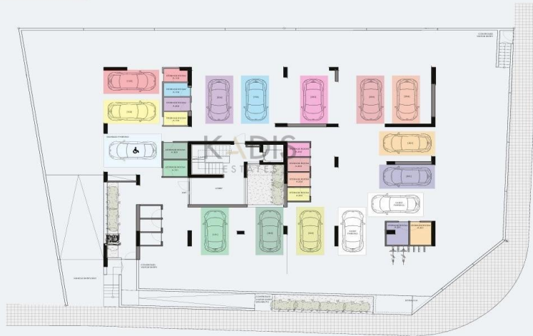
1 st Floor