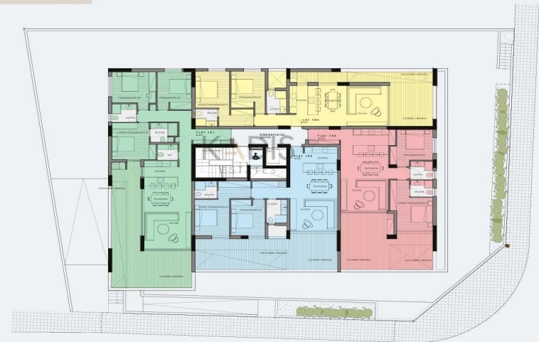
2 st Floor