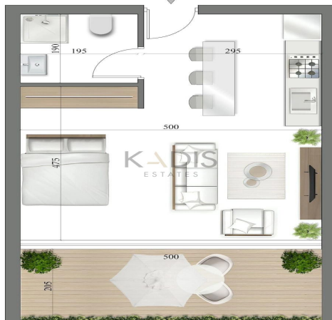
STUDIO 35 SQM + 10 SQM COVERED