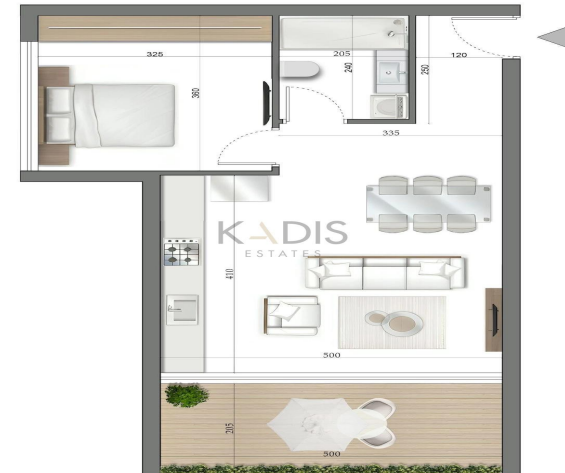
2 BEDROOMS 53 SQM + 10 SQM COVERED