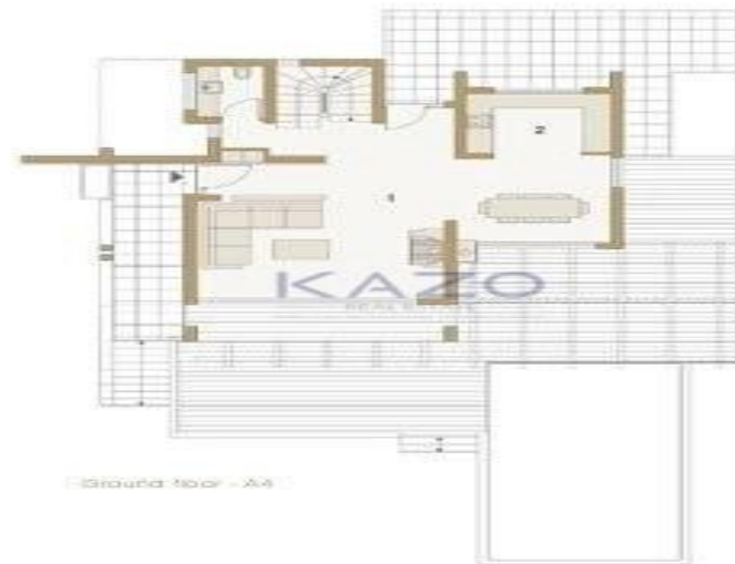
Ground floor - A3