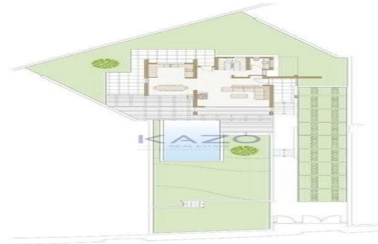
Landscape view - A4B