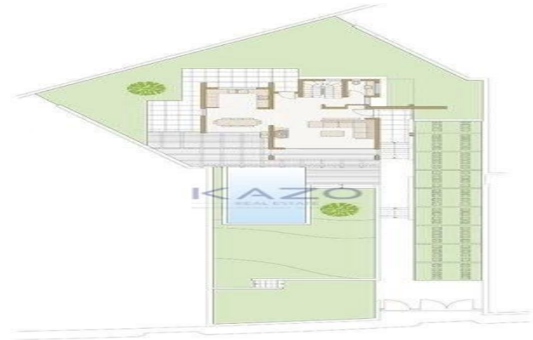
Landscape view - A4B