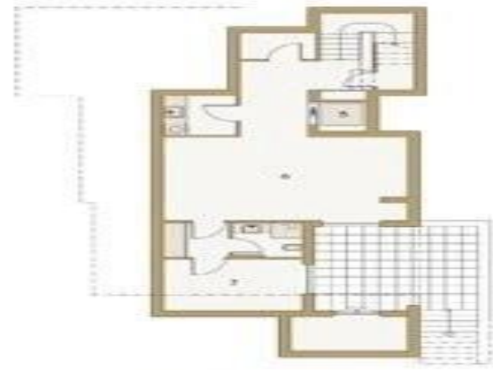
Lower ground floor