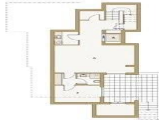
Lower ground floor