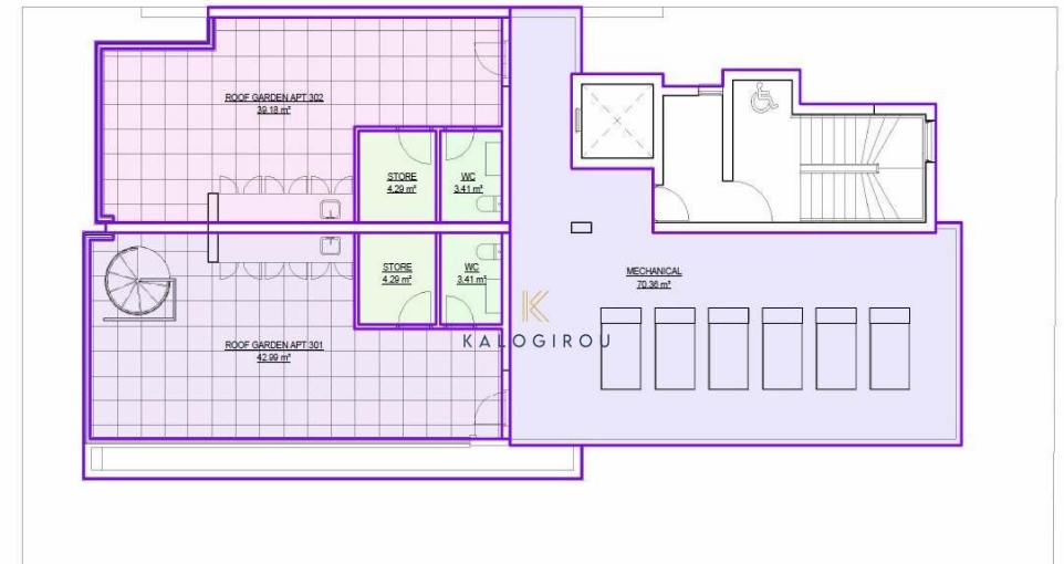
① Roof 1:100