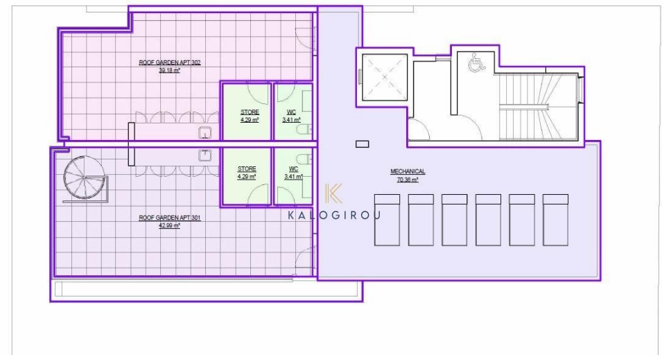
① Roof 1:100