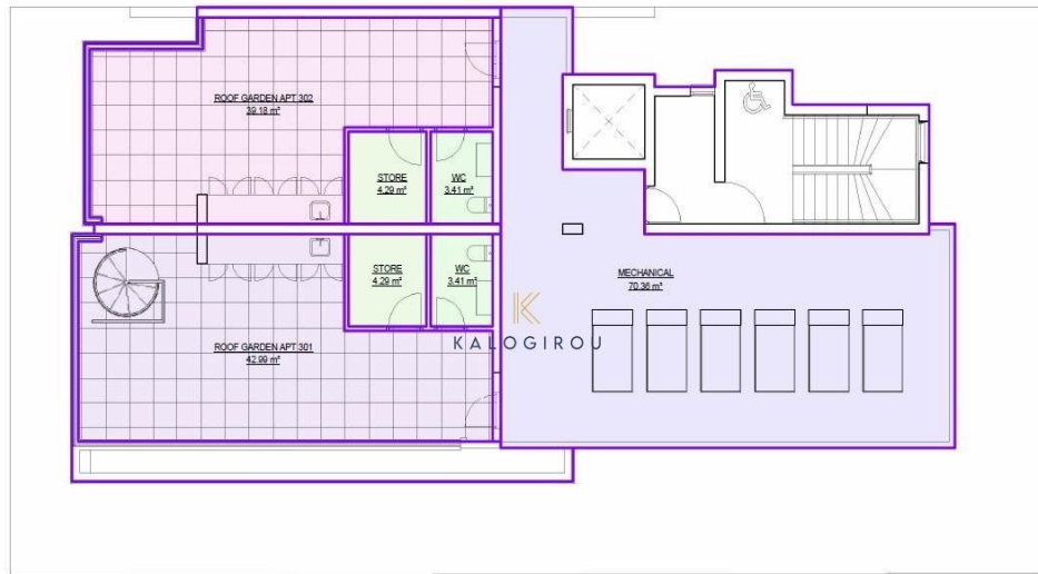
① Roof 1 : 100