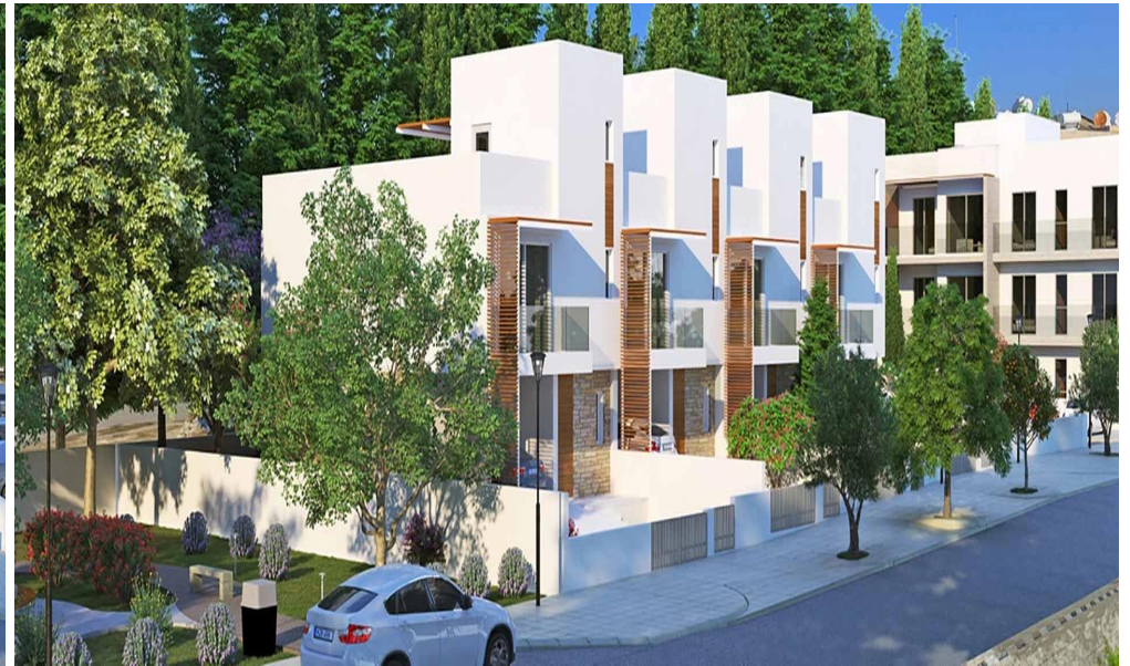
ONERO RESIDENCES / BLOCK D / MAISONNETTE 13