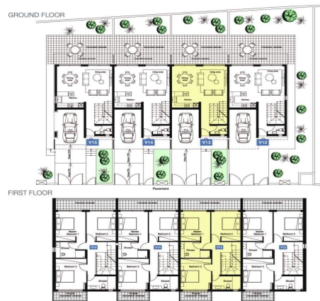
3 BEDROOM MAISONNETTE