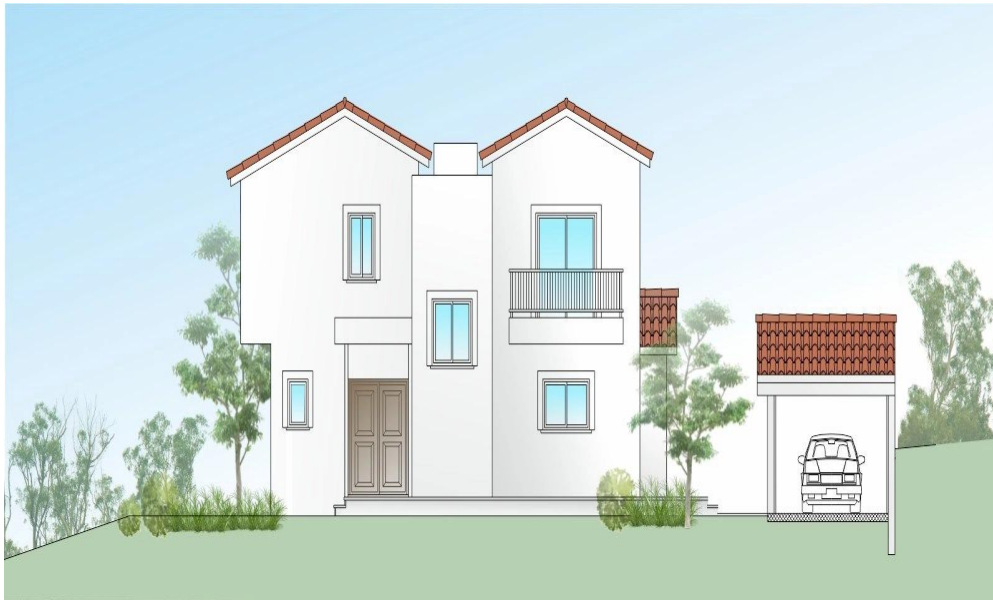
3 BEDROOM VILLA