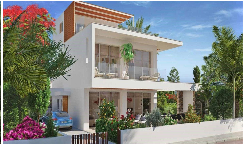
4 BEDROOM VILLA