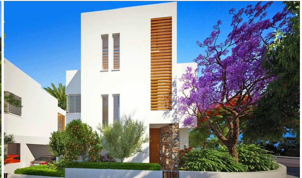
4 BEDROOM VILLA