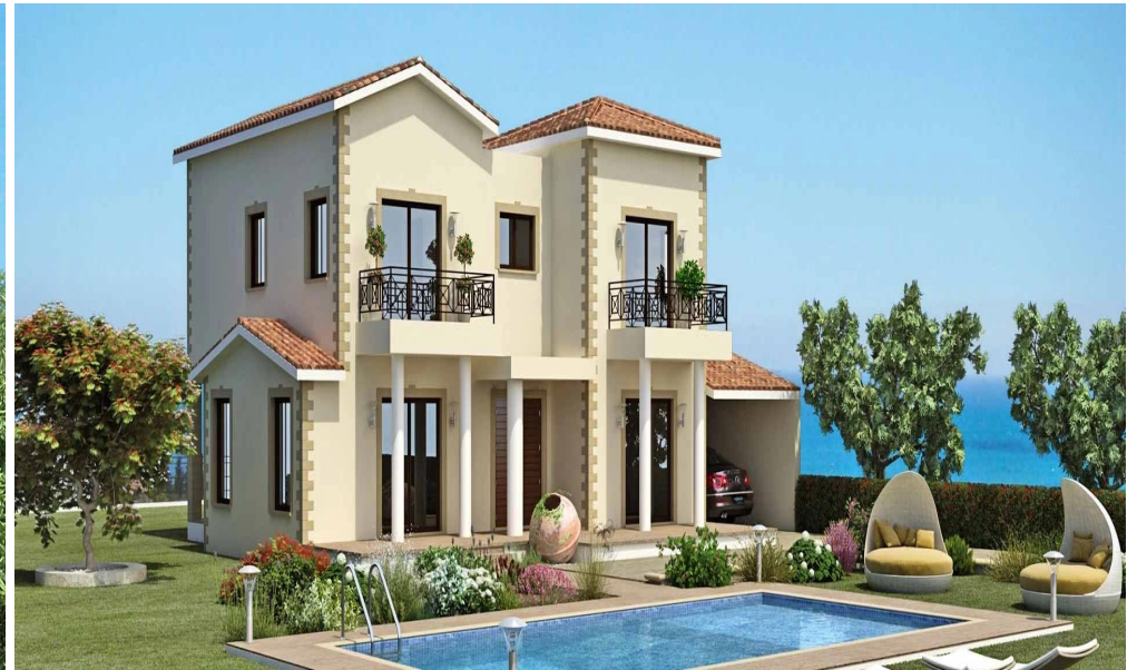
3 BEDROOM VILLA