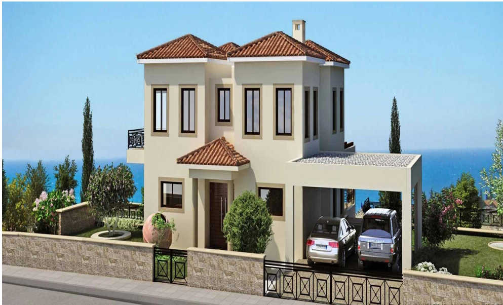
3 BEDROOM VILLA